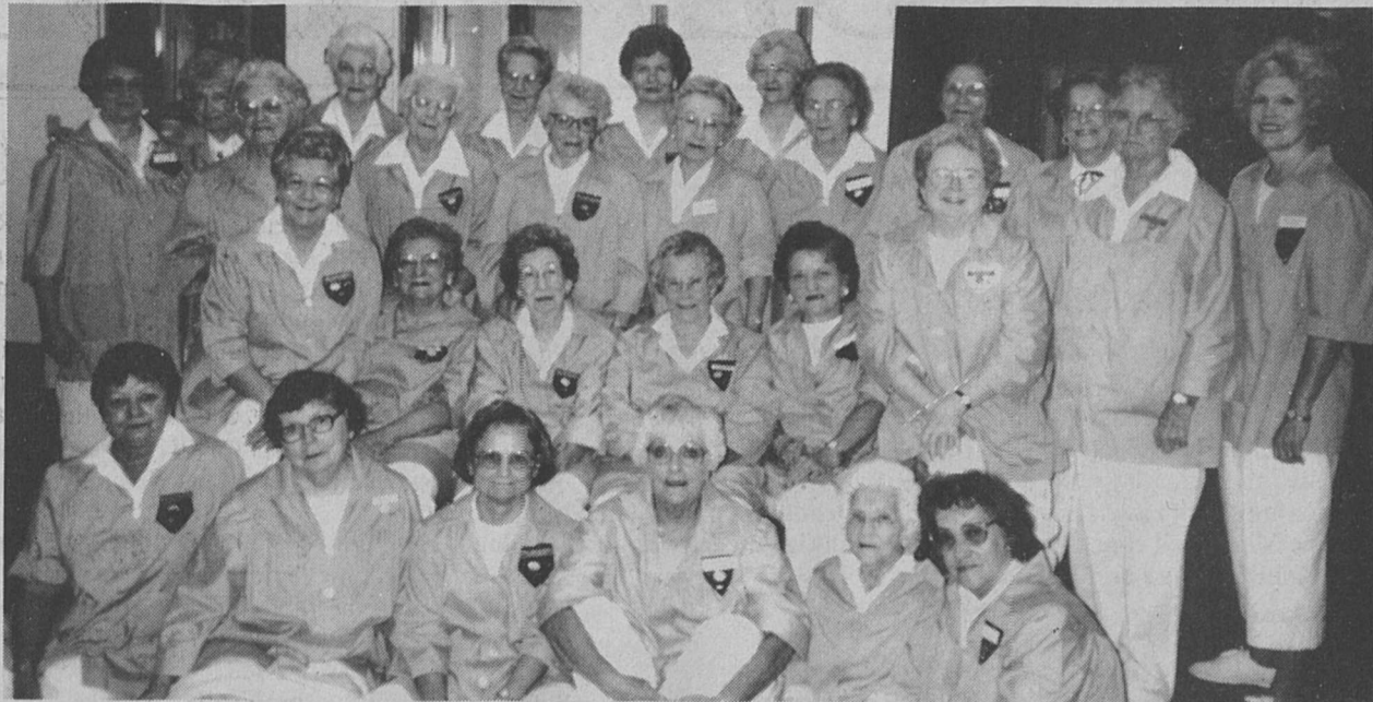
Rice Medical Center's 'Pink Ladies'

It's not for money, it's not for fame; It's not for any personal gain. It's not for love of fellowman, It's just to lend a helping hand, It's just to give a little of self. That's something you can't buy with wealth, It's not for medals worn with pride It's not that feeling deep inside, It's that regard down in your heart, It's feeling that you have a part Of Helping others far and near That makes you be a Volunteer!!!